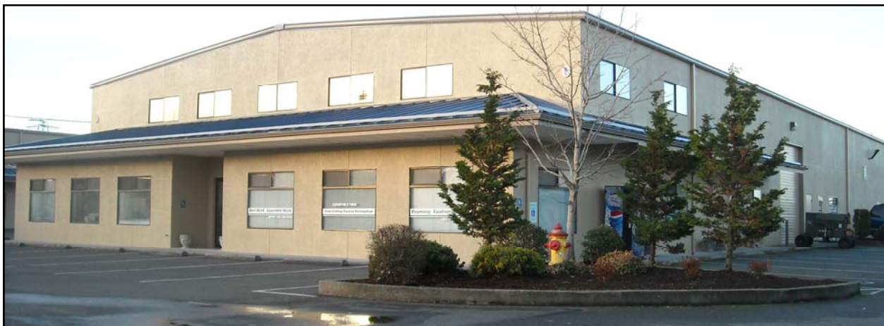
Building F: Western WA Sheet Metal, Scamp, Inc., CAR-BER Testing Services, Office, Warehouse and Industrial