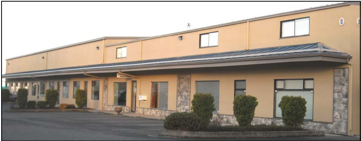
Building E: Whatcom/Skagit Housing, QMS, SAB Recycling, Office, Warehouse and Industrial